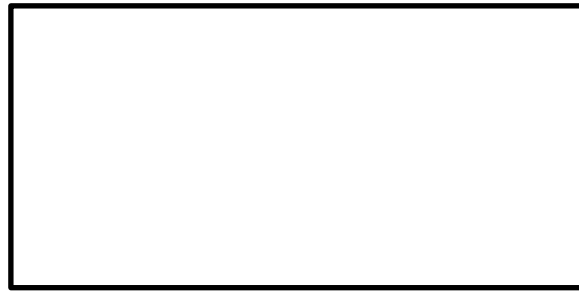
Figure 1 The system of ..... (Centered in an inverted triangle shape.)